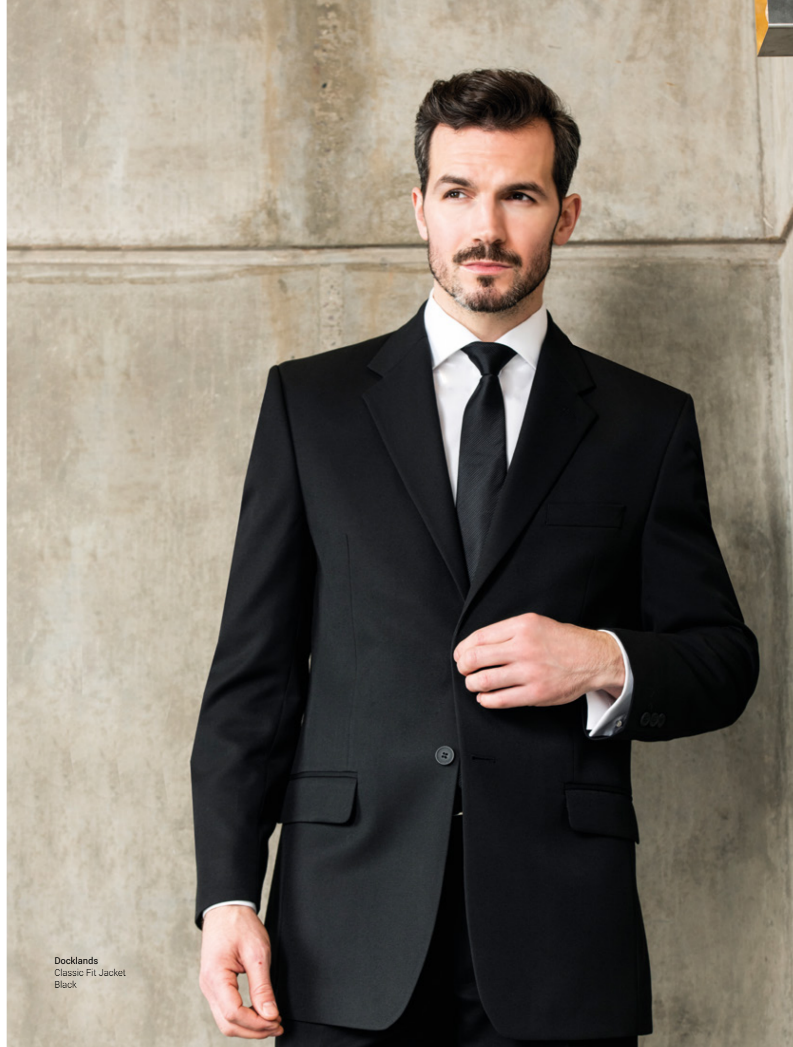
Docklands Classic Fit Jacket Black