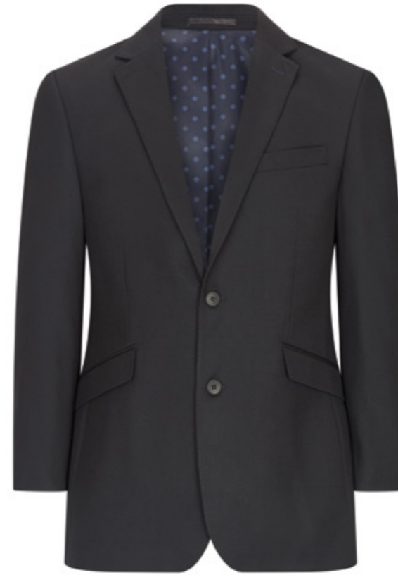
Titanium Tailored Fit Jacket

With notch lapels, a two button fastening and a tailored fit, this men's suit jacket makes the perfect jacket for any workplace. This tapered look boasts modern comfort and practicality.