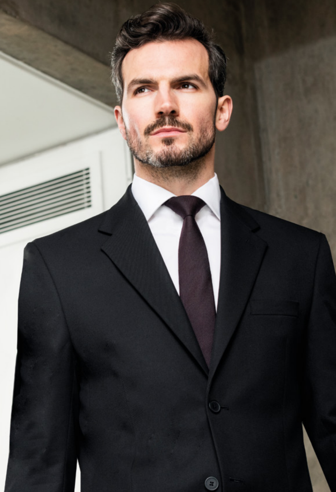
Dockland Classic Fit Jacket Endurance Poly Wool Black