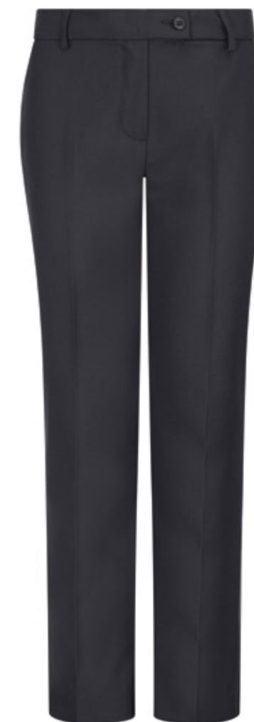
Chelsea Tailored Fit Trousers

Regular Length UK 4 – 24 EU 32 – 52 58cm | 23" length Long Length UK 6 – 24 EU 34 – 52 64cm | 25" length