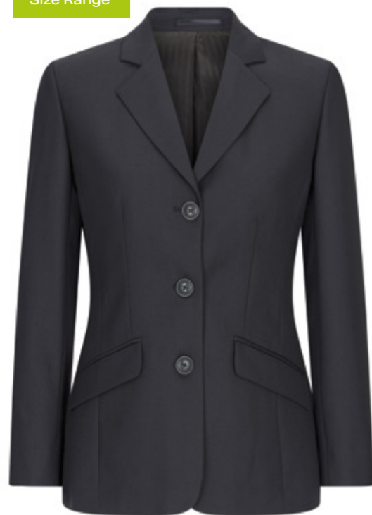
Bankside Classic Fit Jacket

Designed to create a classic silhouette allowing for ease of movement and extra comfort throughout the working day. Single breasted to keep the shape fitted with flap front pockets add statement details that catch the eye and offer a sophisticated look.