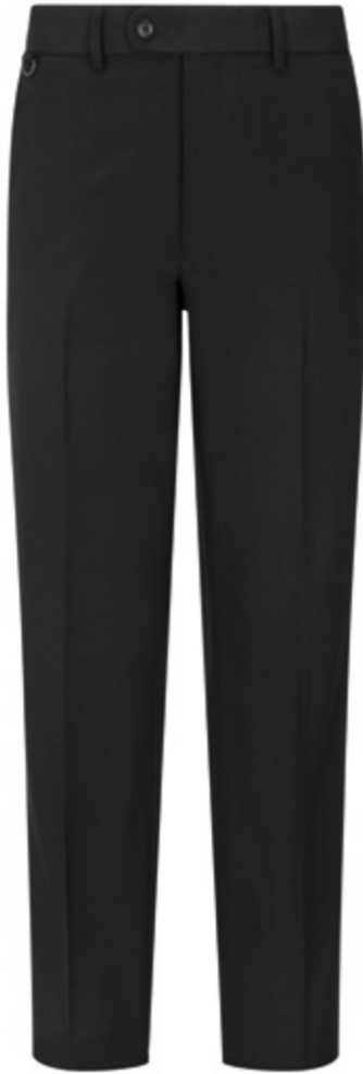
Olympia Mens Tailored Fit Trousers