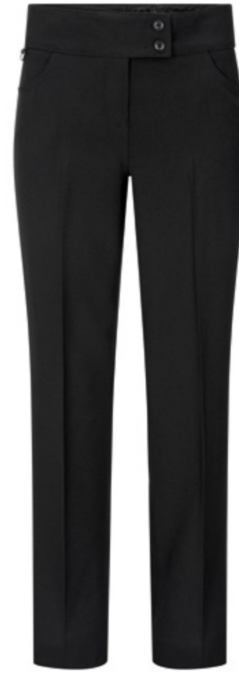
Ascot Ladies Tailored Fit Trousers