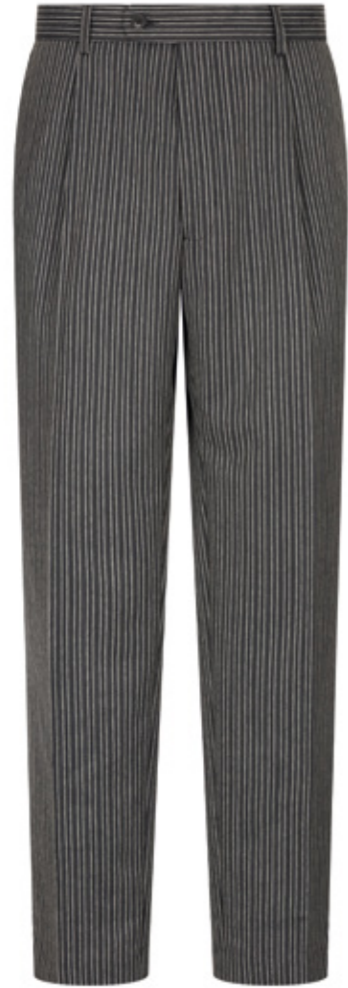
Principle Stripe Grey Formal Stripe Classic Fit