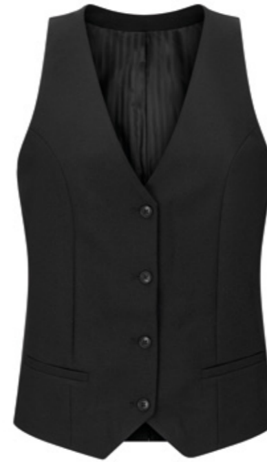
Wimbledon Ladies Waistcoat