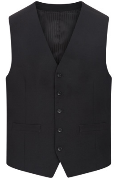
Oval Mens Waistcoat

XS S M L XL XXL 4/6 8/10 12 14/16 18/20 22/24